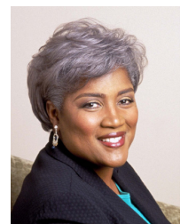
DONNA BRAZILE Political Commentator

Conference Registration Urban Schools Resource Room/Internet Cafe General Session A: Breakfast and Address from Chair of the Board CONCURRENT SESSIONS ON BEST PRACTICES General Session B: Lunch and Speaker: TBD CONCURRENT SESSIONS ON BEST PRACTICES Executive Committee Meeting Cocktail Reception 27th Annual Green-Garner Banquet ( Semi Formal Evening Attire ) Hospitality Suite- Karaoke Night