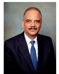
ERIC HOLDER Former U.S. Attorney General

Conference Registration Urban Schools Resource Room/Internet Cafe General Session C: Breakfast and Speaker: DONNA BRAZILE CONCURRENT SESSIONS ON BEST PRACTICES General Session D: Lunch and Speaker: ERIC HOLDER General Session E: Town Hall Meeting Urban Education and the Presidential Campaign Moderated by: DAN RATHER Great City Colleges of Education General Meeting Reception at the Biscayne Lady Yacht